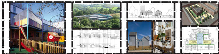
Domino House, Annedd Elderly Care Home, Escape Housing, Haghill Conversion- with PCKO Architects